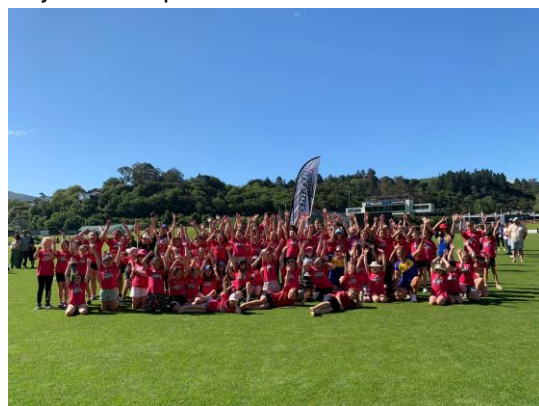
Girls Smash Festival - The University of Otago Oval

The girls have an action-packed experience and leave looking forward to coming back the next week. Key to the experience of Girls Smash is music being played around the ground. Otago Cricket