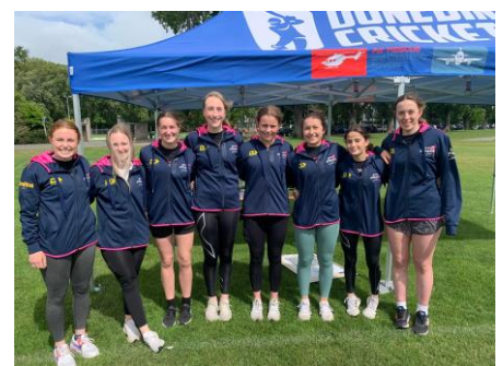
Girls Smash Game Leaders - Dunedin