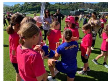
WHITE FERN & Otago Spark, Suzie Bates signing autographs

Girls Smash was initially planned to start in Dunedin term 4 2016. However, there was little interest. The plan was reviewed, and it was identified term 1 was a better fit (around other sports and activities). Further work was also undertaken in schools to generate interest and raise awareness of the programme. In term 1 2017, Girls Smash was officially underway.